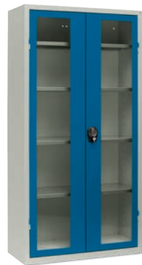
131V000114 (+ 4 stk. 431V0008)