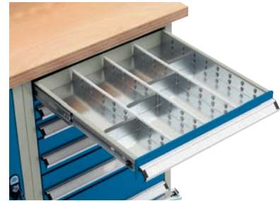
Steel dividers 4 x 110 mm