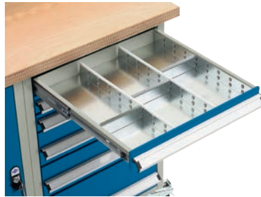
Steel dividers 3 x 148 mm