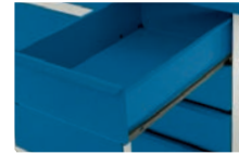
VV-2 drawer runners